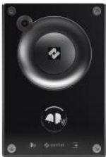
TCIV-3+ IP and SIP Video Intercom