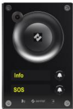
TCIV-5+ IP and SIP Video Intercom