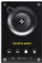
TCIV-6+ IP and SIP Video Intercom