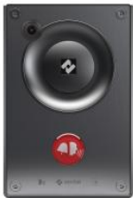
TCIV-2+ IP and SIP Video Intercom