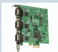
PX-431: PCIe 3xRS232 1MBaud