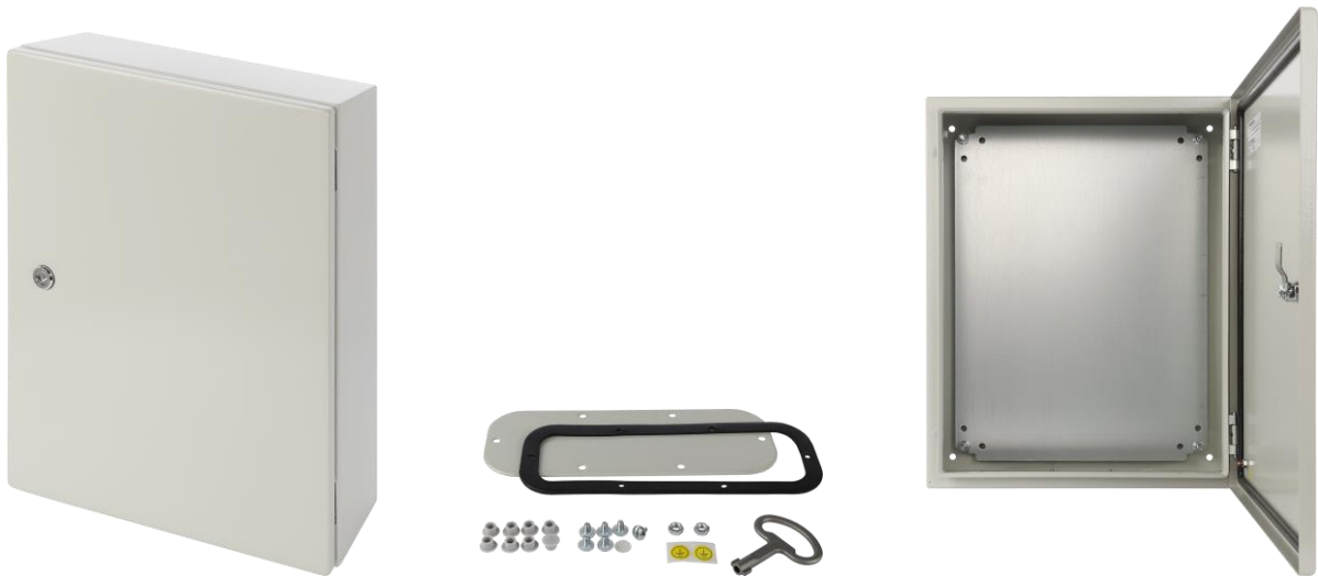
Fig. 1. View of enclosure.