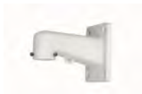
DH-PFB305W Wall mount bracket