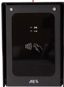
Gate/Entrance 3 Auxiliary Prox Unit