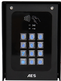
Gate/Entrance 2 Auxiliary Keypad Unit

Standalone GSM/4G keypad system. A great solution for security by covering those extra entrances/gates/doors.