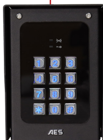
Gate/Entrance 4 Auxiliary Prox & Keypad Unit