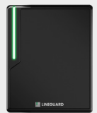
Line Ultra Touch