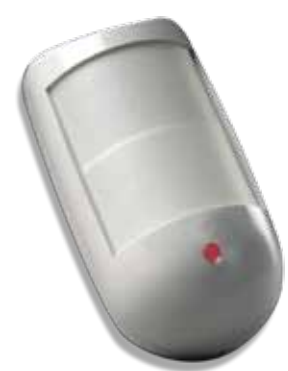
AMB-600 Addressable Pet-Immune Passive Infrared Detector