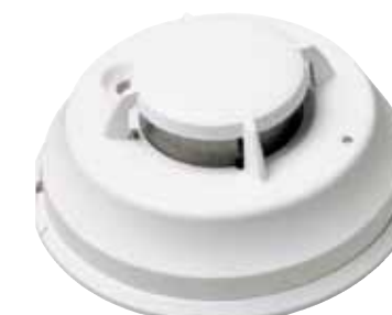
FSA-210/410 Wired Photoelectric Smoke Detector