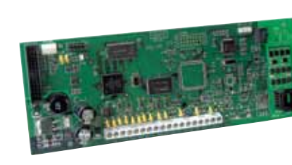
T-LINK™ TL250CE Internet Alarm Communicator