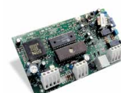
ESCORT™ 4580 Telephone Interface and Automation Control Module