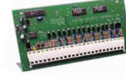
PC4216 16 Programmable Output Module