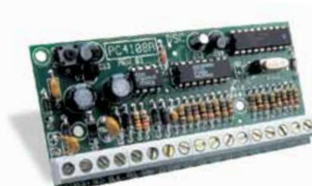
PC4108A & PC4116 8/16 Hardwire Zone Expanders