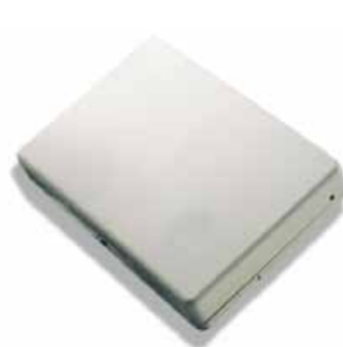
RF4164 Wireless Receiver Supports: - 64 Wireless Zones - 16 Wireless Keys