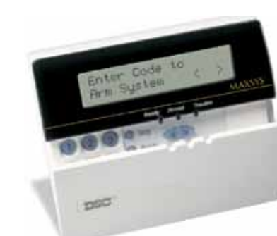
LCD4501 Programmable-Massage LCD Keypad