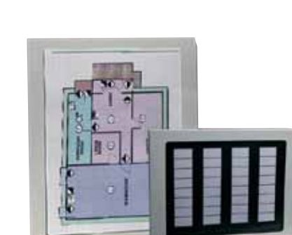
PC4632/4664 32/64 Point Graphic Annunciators