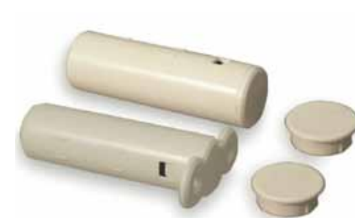
EV-DW4917 Wireless Recessed Door Transmitter