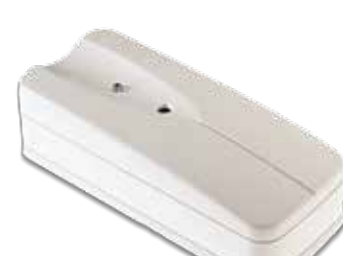
WLS912L-433 Wireless Glass-Break Detector