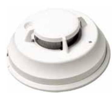
FSB-210 Series Addressable Photoelectric Smoke Detectors