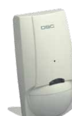
LC-102-PIGBSS Glassbreak Detector with Pet-Immunity