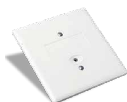
AML-770B Loop Isolator Module