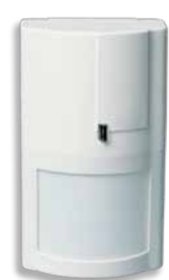
WS4904W/WS4904PW WS904PW/WS 8904W Wireless Passive Infrared Detectors