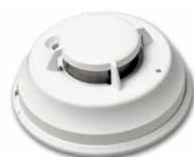
WS4916EU/WS8916W Wireless Photoelectric Smoke Detector