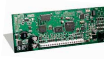
T-LINK™ TL300CE Universal IP Alarm Communicator