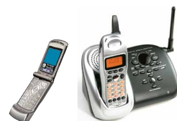
Local/Remote Control with Voice Prompt