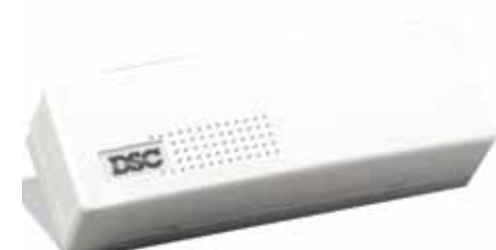
AMP-700/AMP-701 AMP-702/AMP-704 Addressable Contact Modules