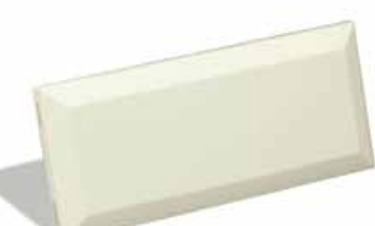
WS4975W Vanishing Contact