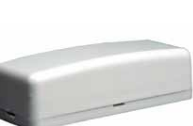
WS4945W/WS8945W Wireless Pet-Immune Passive Infrared Detector