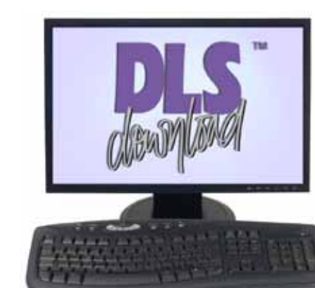
DLS2002 Downloading Software