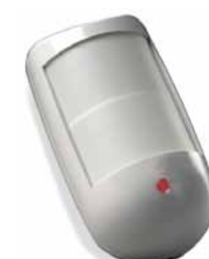
BV600 Dual-element, Pet-Immune PIR Motion Detector