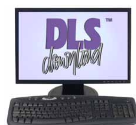
DLS2002SA System Administrator