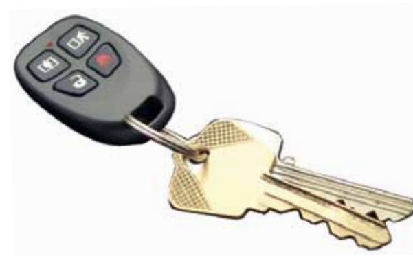
WS4939EU/WS8939W 4-Button Wireless Key