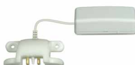
WS4985W/WS8985W Wireless Flood Detector