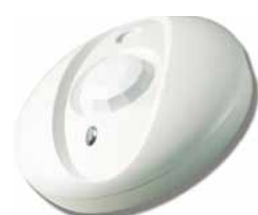
AMB-500 Addressable Ceiling-Mount Passive Infrared Detector