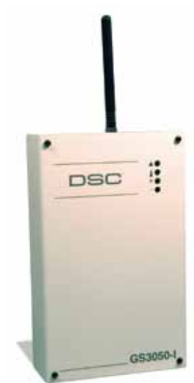
GS3055-IGW Universal Wireless Alarm Communicator