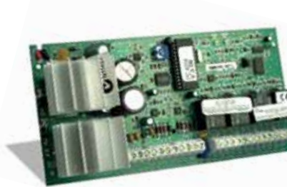
PC4204/PC4204CX Power Supply/Relay Output/Combus Repeater Module