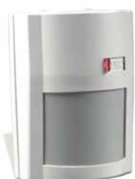
AMB-300 Addressable Passive Infrared Detector