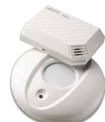
AC100/AC500 Glassbreak Detector