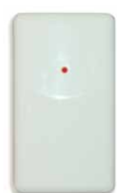
WS8965W Tri-Zone Wireless Door/Window Contact