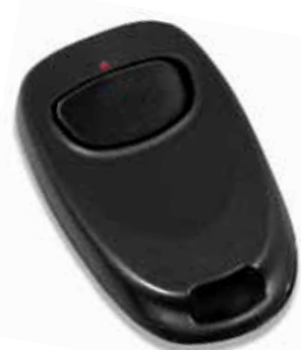
WS4938W/WS8938W 1-Button Personal Panic