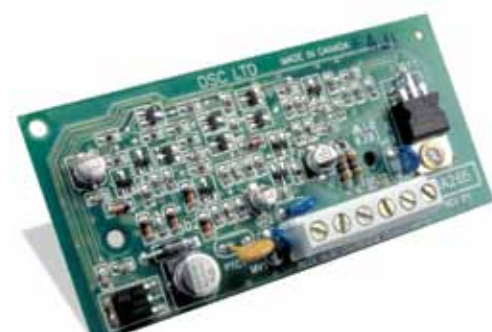
AMX-400 Loop Repeater/Isolator Module