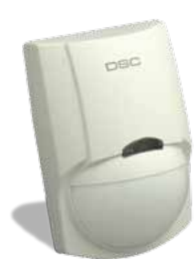
LC-100-PI-6PK PIR Detector with Pet-Immunity