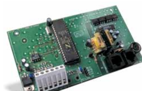
PC4401 Data Interface Module