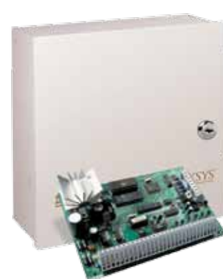
PC4820 2-Reader Access Control Module